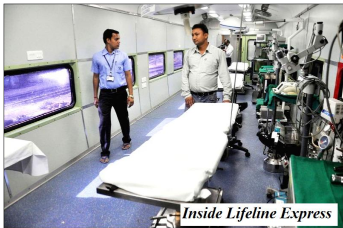
Inside Lifeline Express